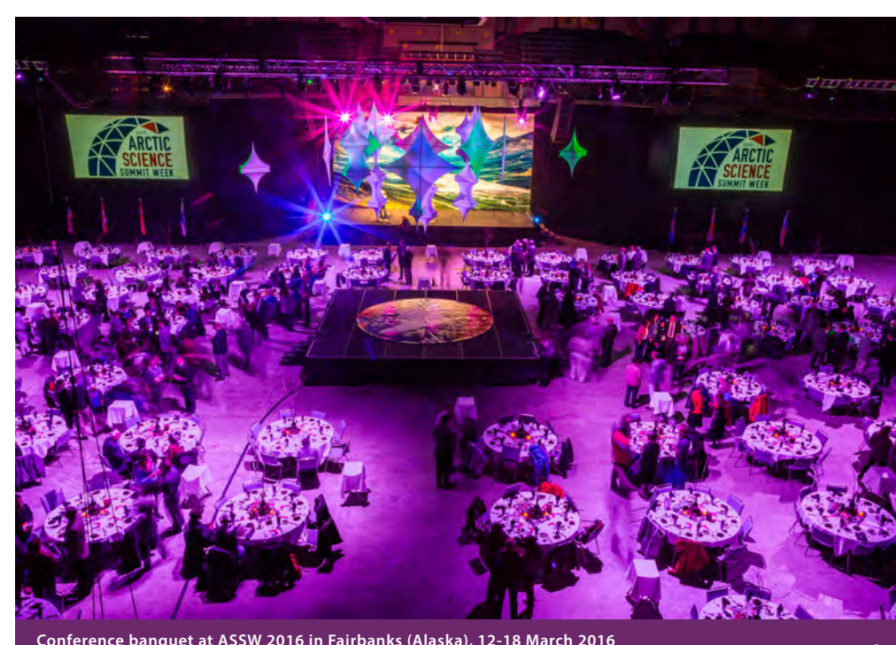
Conference banquet at ASSW 2016 in Fairbanks (Alaska), 12-18 March 2016

Since 1999, IASC and its partner organizations convene the annual Arctic Science Summit Week (ASSW). With more than 1000 participants from more than 30 different nations and more than 130 different institutions, the ASSW 2016 was the largest ever. The Summit, hosted by the University of Alaska Fairbanks on 12-18 March, included both the business meetings of the various ASSW partner organizations, including numerous side meetings, but also the 3<sup>rd</sup> Arctic Observing Summit (see next page). For the first time, the Arctic Council decided to use the ASSW to hold the Senior Arctic Officials meeting back to back with the scientific meetings. The International Arctic Assembly Day in the middle of the week provided an excellent opportunity for a dialogue between scientists and policymakers to translate scientific research into specific plans and actions responding to a rapidly changing Arctic. For more information please see www.assw2016.org.