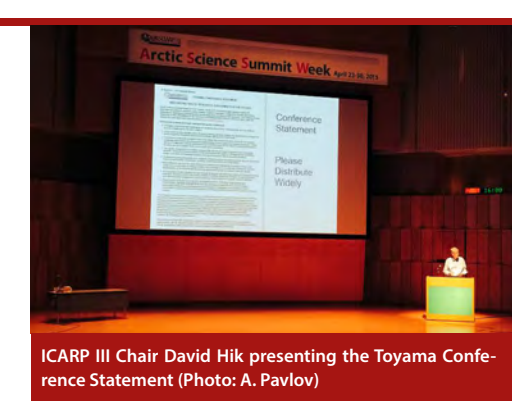
by adopting shared principles to guide research