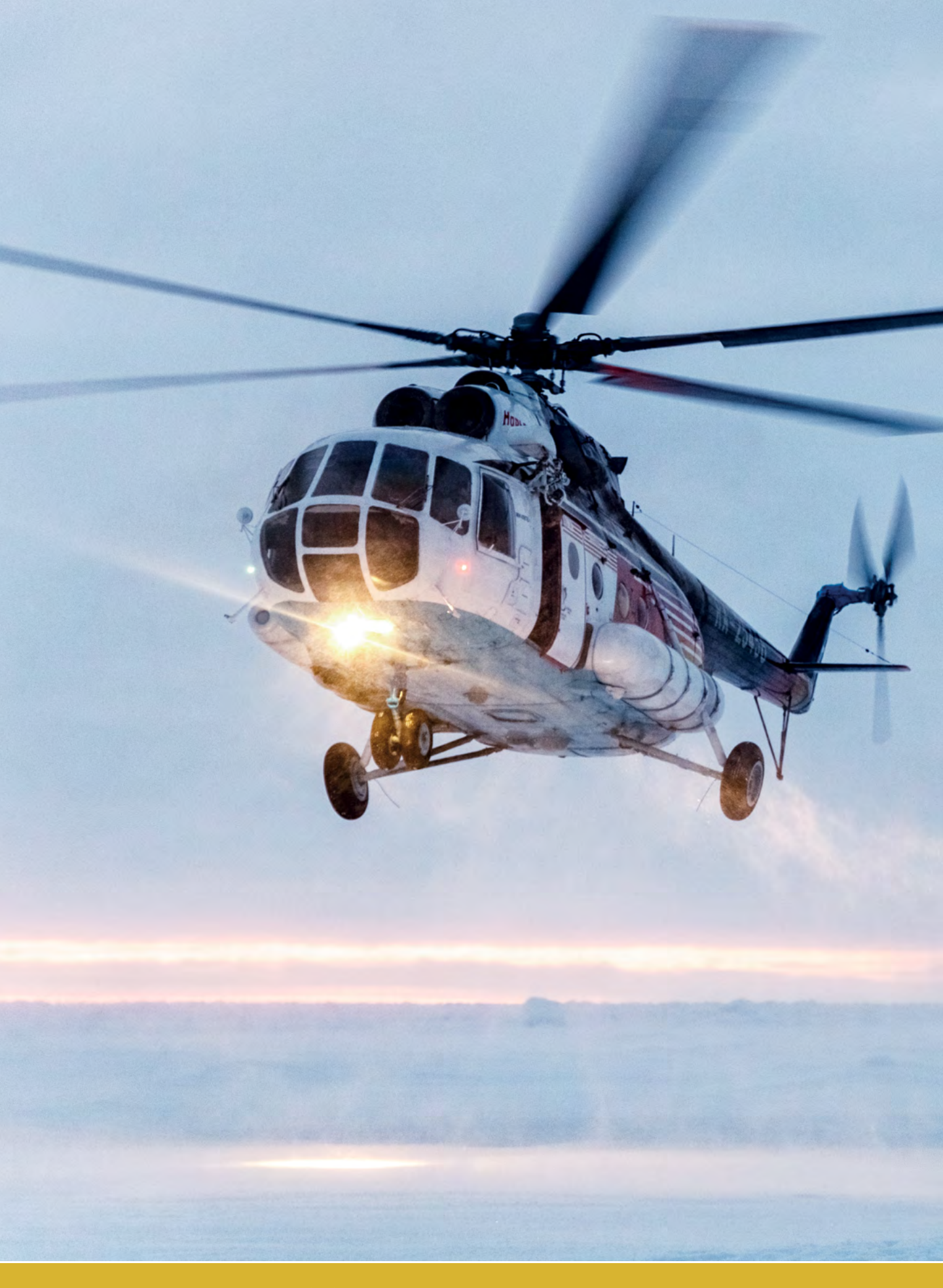
Ai-R beliganter landing next to researchers and hear quards during deployment of the Distributed Network, MOSAiC Expedition