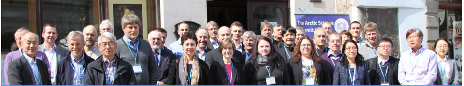
IASC Cryosphere Working Group at the ASSW 2013 in Krakow, Poland