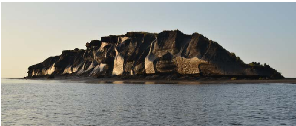
Muostakh Island, Laptev Sea

Forbes, D. L. (ed.) 2011. State of the Arctic Coast 2010: Scientific Review and Outlook. International Arctic Science Committee, Land-Oceans Interactions in the Coastal Zone, Arctic Monitoring and Assessment Programme, International Permafrost Association. Helmholtz-Zentrum, Geesthacht, Germany, 178p. http://arcticcoasts.org .