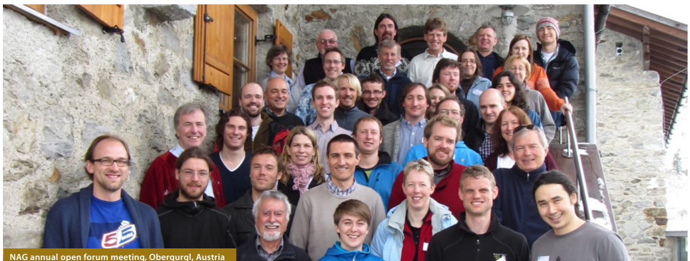
NAG annual open forum meeting, Obergurgl, Austria