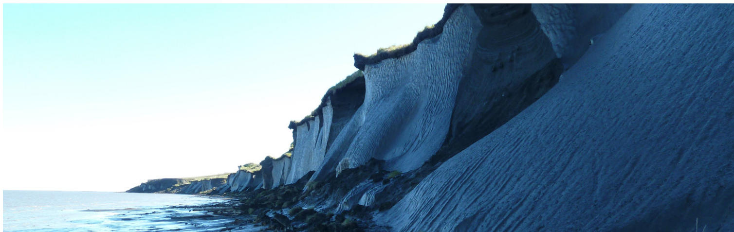
Mamontovy Khayata on the Bykovsky Peninsula