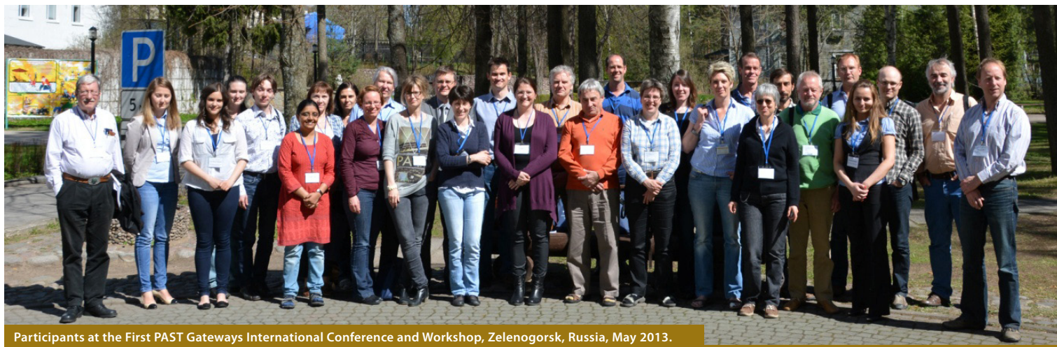
Participants at the First PAST Gateways International Conference and Workshop, Zelenogorsk, Russia, May 2013.